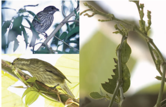
Fig. 1. Top left, a female Puerto Rican Spindalis feeding on mature leaves of day jasmine ( Cestrum diurnum , Solanaceae) in an urban area of San Juan, Puerto Rico. Beak marks are visible on the leaves of the day jasmine. Bottom left, a female Puerto Rican Spindalis feeding on young shoots of a winged yam ( Dioscorea alata , Dioscoraceae) in Carite State Forest in Cayey, Puerto Rico. Right, beak marks left on a mature leaf of mistletoe ( Phoradendron bexastichum , Viscaceae) by a male Puerto Rican Spindalis in Carite State Forest.